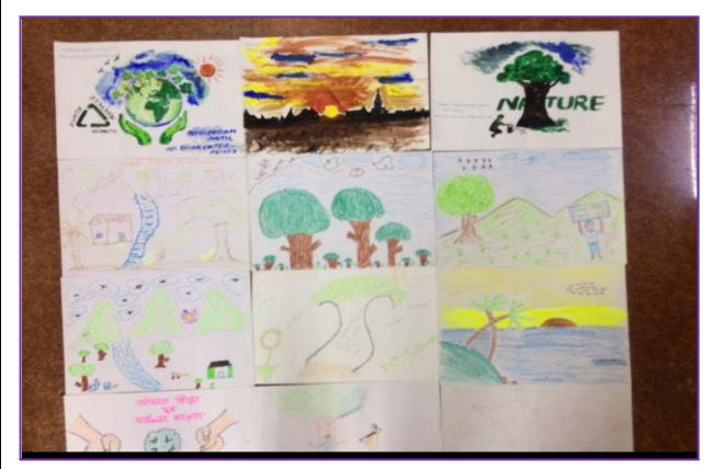
Drawings by the participants