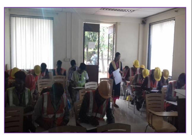
HSE representative explaining theme