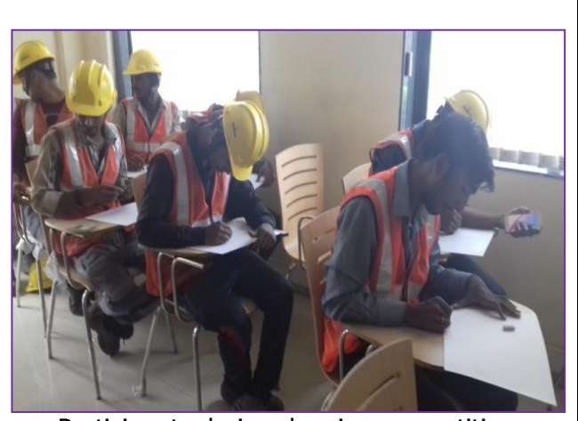
Participants during drawing competition