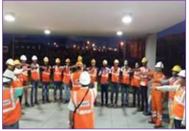
Environment Pledge with staff