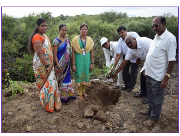
Tree plantation at village