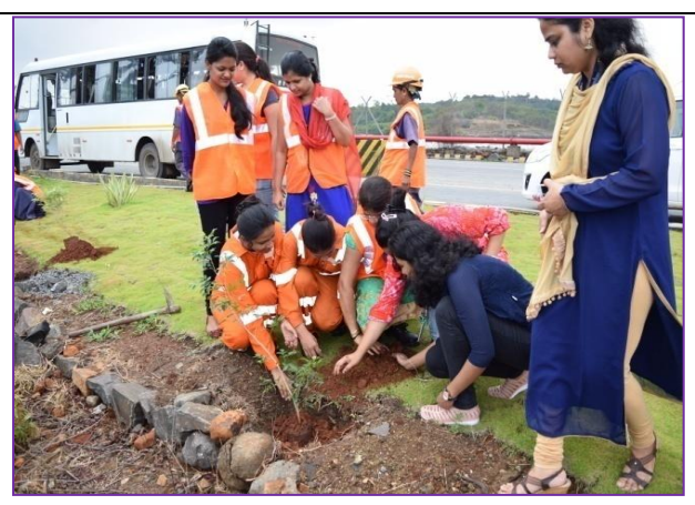
Ladies participating in tree plantation