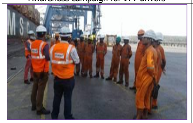
Awareness campaign with Lashers and checkers