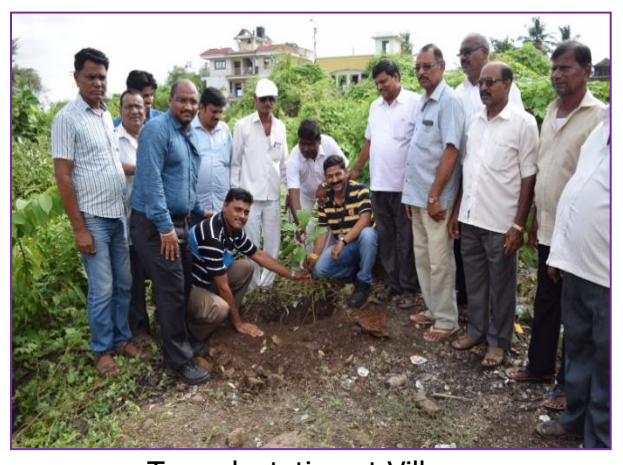
Tree plantation at Village