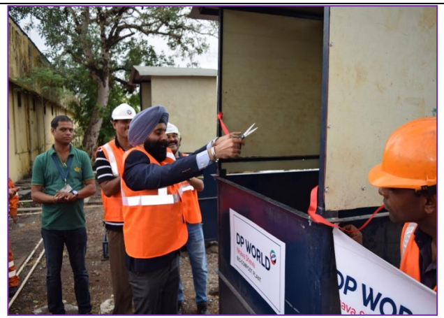
Inauguration by CEO