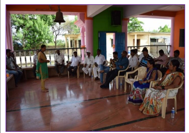
Awareness campaign at Nhava khadi Village

A program on Environment was arranged in a village named Nhava Khadi, The support and involvement was excellent from crowd. The efforts were appreciated by the crowd and they assured continuous support for such initiatives. Tree plantation drive was held at the premises. Below points were discussed in awareness campaign – water, air pollution, increased water consumption - Limited resources, How to reduce pollution, easy steps to implement Reduce – Reuse & Recycle concept, Importance of planting and protecting trees.