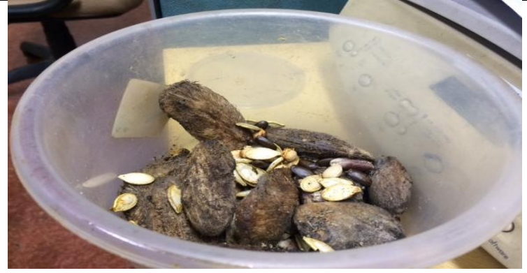
Different vegitables and fruits seeds collected by employees

Many employees took active participation and involved their family members in this challenge.