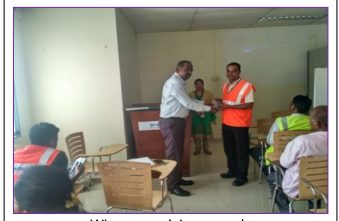
Participants during competition