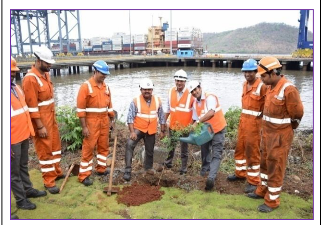
Engineering team while planting trees

As a part of World Environment week celebration, trees were planted inside the Terminal. HSE representative discussed importance of preserving our natural resources, mother earth, protecting and planting of trees.