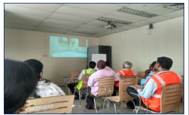
Awareness Videos shown to Contracted Staff

The awareness sessions with management employees and contracted staff was conducted through Environmental messages throughout the week, banner display, tool box talks and notice board displays etc.