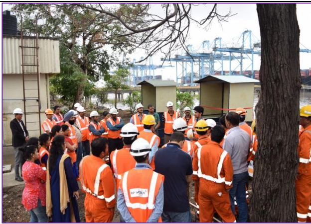
HSE reprensatative explaning importance of Bio compost plant